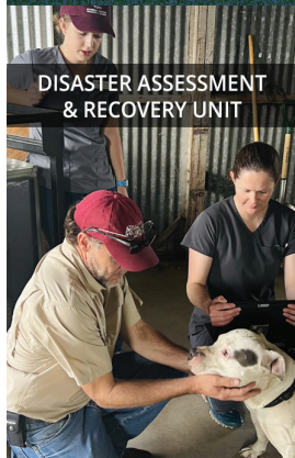
DISASTER ASSESSMENT & RECOVERY UNIT

250 OFFICES SERVING ALL 254 COUNTIES IN TEXAS 20.8M ANNUAL DIRECT TEACHING CONTACTS 78,051 VOLUNTEERS GIVING 3.2 MILLION HOURS OF SERVICE 381,935 TEXAS 4-H PARTICIPANTS